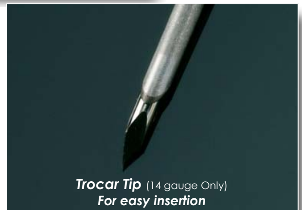
Trocar Tip (14 gauge Only) For easy insertion