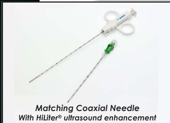
Matching Coaxial Needle With HiLiter ® ultrasound enhancement