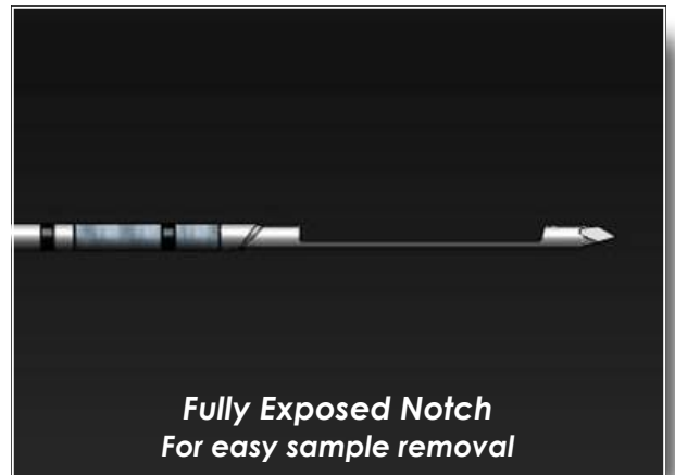
Fully Exposed Notch For easy sample removal